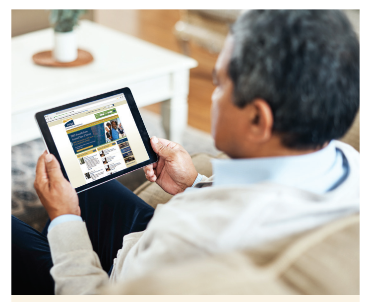
The change in IMRF's assumed rate of return DOES NOT affect IMRF retirement benefits, which are fixed by state law.

The difference between the cost of IMRF retirement benefits and member contributions must be paid by a combination of employer contributions (funds from local units of government) and investment earnings.