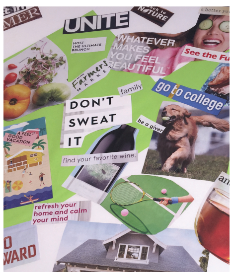
A "bucket list" collage.