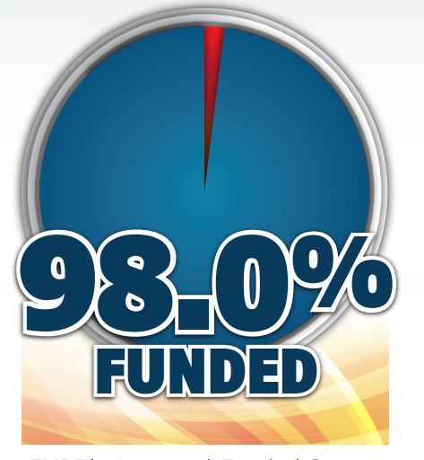
IMRF's Actuarial Funded Status

Funded status is a key barometer of a pension plan's fiscal health. The typical U.S. pension plan is about 74.9% funded, according to the National Association of State Retirement Administrators. IMRF's 98.0% funded status means it has on hand today nearly all the money needed to pay the entirety of its pension obligations to all current retirees as well as all active workers.