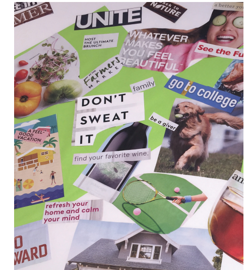
A "bucket list" collage.